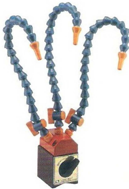
ORDER NO. VMH-62 (3 HOSE) MAGNETIC BASE WITH HOSE NOZZLE