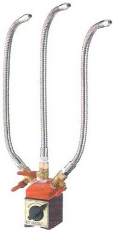
ORDER NO. VMH-65 (3 HOSE) MAGNETIC BASE WITH STEEL NOZZLE