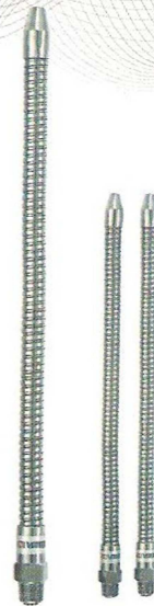
ORDER NO. VMS-1/4 ORDER NO. VMS-3/8 STEEL HOSE WITH NOZZLE